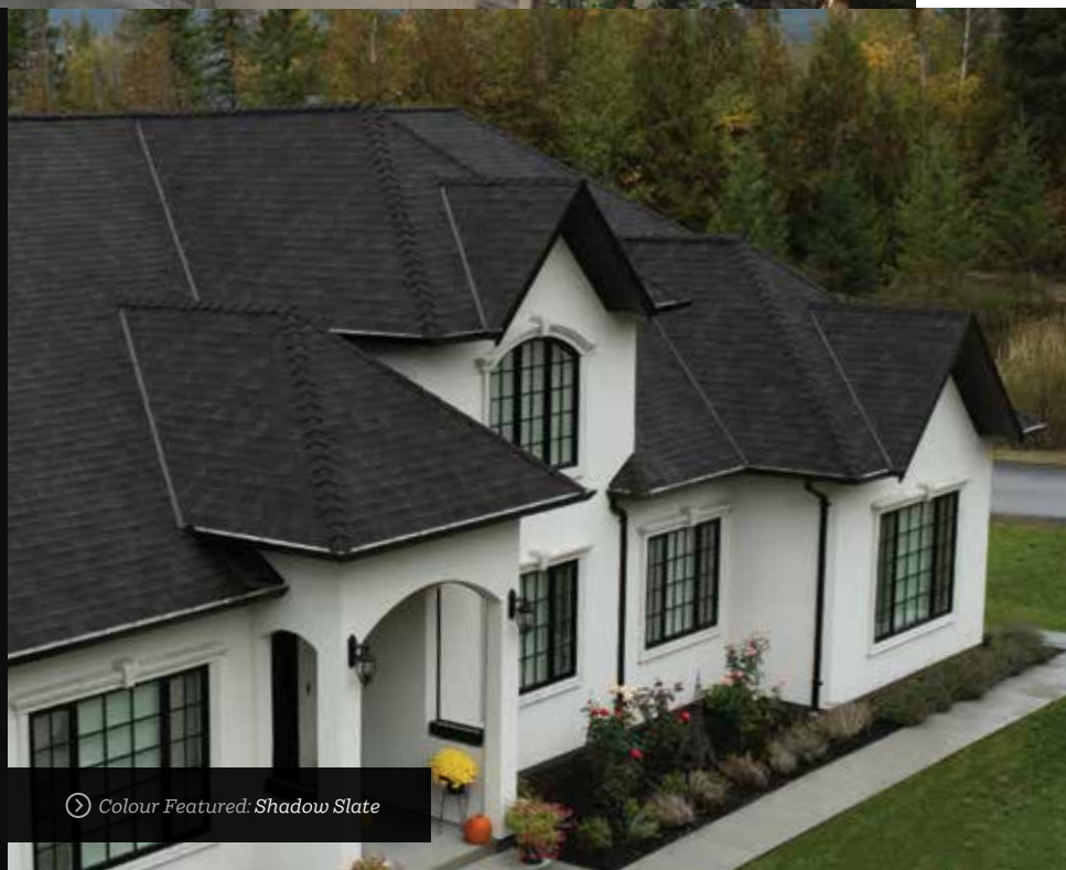
➤ Colour Featured: Shadow Slate

ASTM D3018 • ASTM D3161 - Class F • ASTM D7158 - Class H • CAN/ULC S107 - Class A • FM4473 - Class 3 5