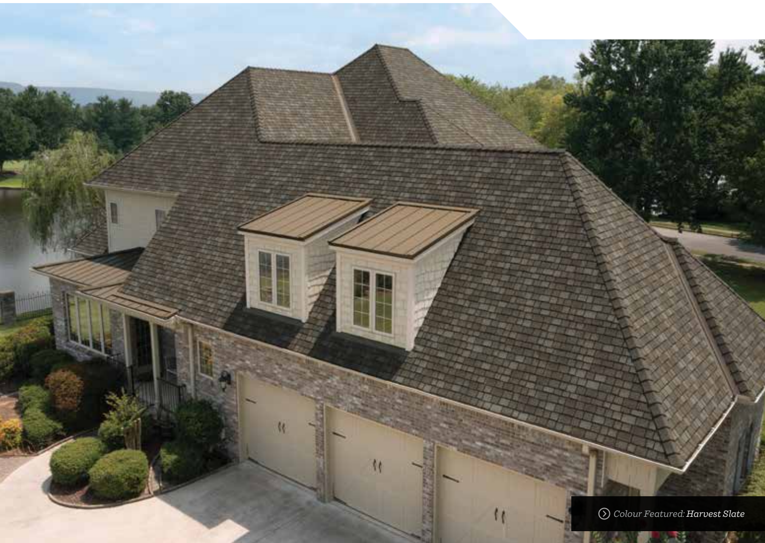
➤ Colour Featured: Harvest Slate